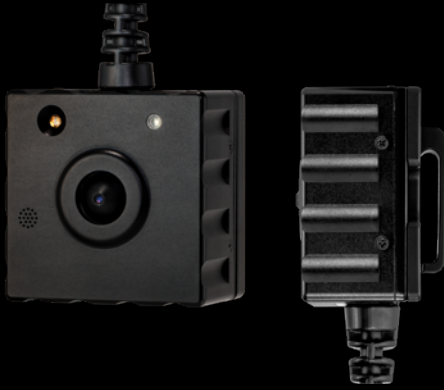
Universal Mounting System 1/4-20 Mounting Plate & Clip Included