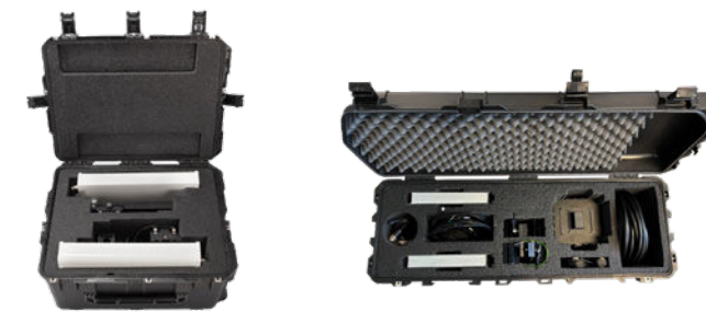
Antenna Transit Case