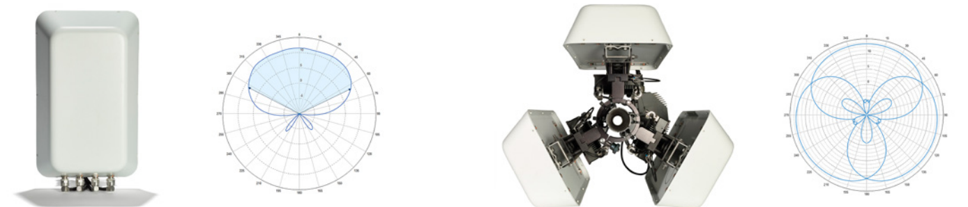
Single Sector Coverage (50° to 120°)

StreamCaster PRISM - Extend the range of your network, by providing a blanket of coverage throughout your area of operation.