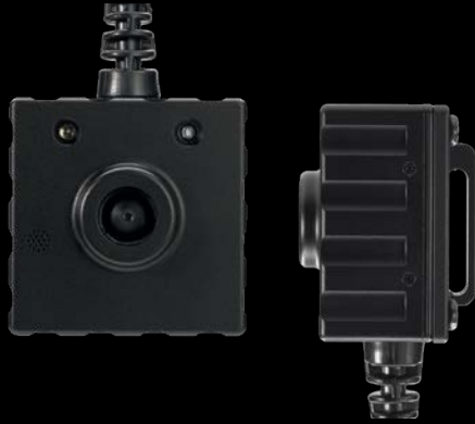
Universal Mounting System 1/4-20 Mounting Plate & Clip Included