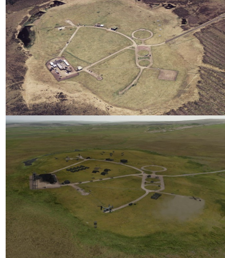
Figure 1. Comparison of Google Earth view and AR representation