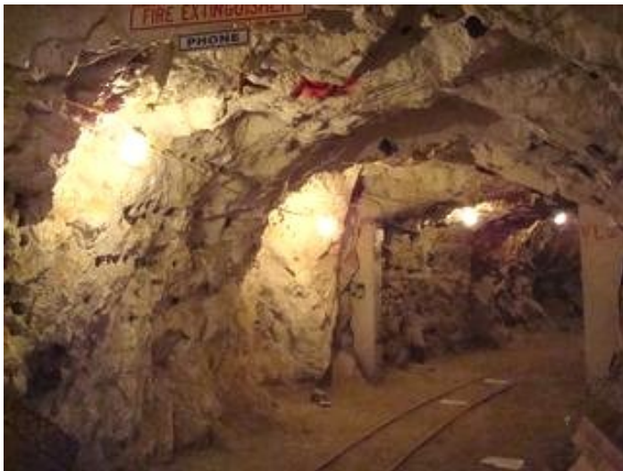
Figure 1. Inside view of tunnel

The purpose was to determine the performance and coverage area Silvus MIMO radios provide in an underground tunnel environment.