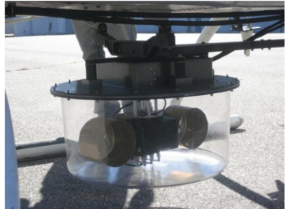
Figure 2. Silvus SC3500 with Troll custom auto-tracking antenna assembly mounted to belly of helicopter