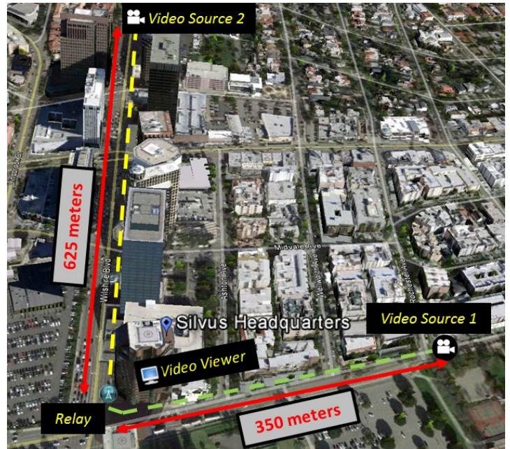
Figure 1. Node Deployment and Mobile Coverage at Silvus HQ

Figures 1 and 2 show the positioning of the Video Viewer and relay nodes in the Silvus HQ setup and the UCLA setup respectively. The green and yellow dashed lines show the paths of Video Source 1 and 2 respectively, starting at the relay node and moving away until the link is lost.