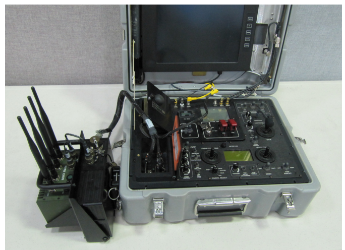
Figure 2. Silvus SC3500 integrated into TALON OCU

Silvus radios have been tested and approved for use by QinetiQ in their TALON robots.