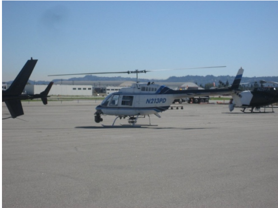
Figure 1. Silvus SC3500 mounted onto helicopter at Troll Systems headquarters in Valencia, CA