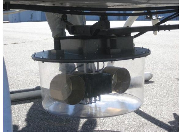
Figure 2. Silvus SC3500 with Troll custom auto-tracking antenna assembly mounted to belly of helicopter