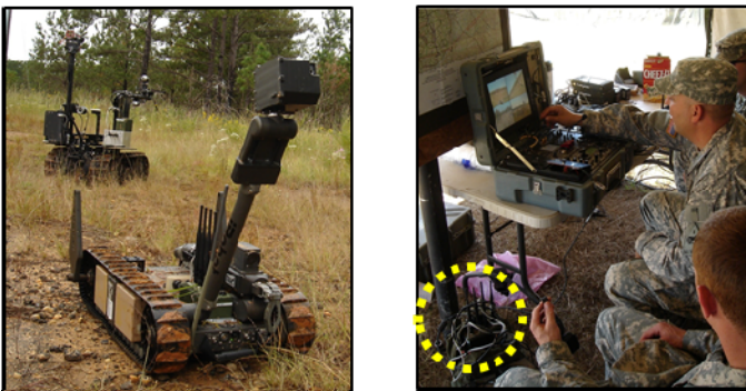
Figure 1. Silvus SC3500 integrated into FasTac & TALON, note the Silvus radio on the ground with the soldiers